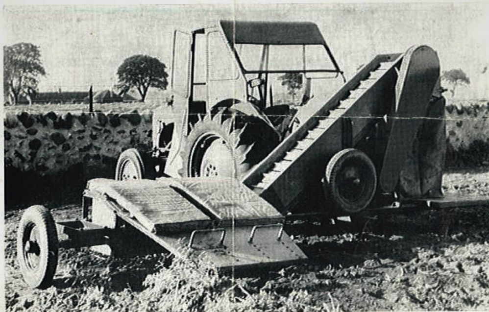
THE 'Featherbed' POTATO PICKER

THE machine consists of a P.T.O. driven slatted conveyor in line with and leading direct to an elevator. Conveyor and elevator move at right angles to the drill being gathered, the potatoes already having been unearthed by a conventional type digger. Over the conveyor part of the unit is a wooden platform to accommodate two pickers lying in the prone position facing their work, the platform being covered with Dunlopillo cushioning.